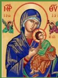
St. Mary's Johnston Street Foxton 4814