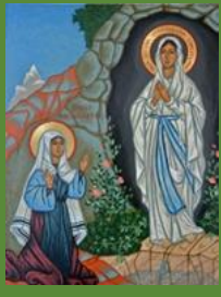
Our Lady of Lourdes 96 Shamrock Street Palmerston North 4412