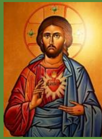
Sacred Heart 6 Mersey Street Rongotea 4476