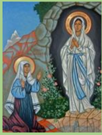
Our Lady of Lourdes 96 Shamrock Street Palmerston North 4412