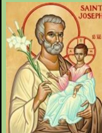
St. Joseph's Cnr Grey & Vogel Street Shannon 4821

8 December 2019 – 2 nd Sunday of Advent – Year A.