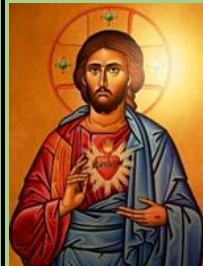
Sacred Heart 6 Mersey Street Rongotea 4476