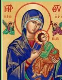
St. Mary's Johnston Street Foxton 4814