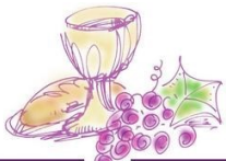
Holy Day of Obligation

Tui Motu's August issue ($7) has also arrived and available for sale at the Cathedral and Our Lady of Lourdes.