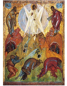
Icon of the Transfiguration by Theophanes the Greek, 15th C